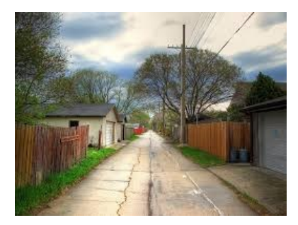
The square footage size must be less than primary structure.

The height of accessory structures shall not exceed 80% of the primary structure's height, or 18 ft, whichever is higher.